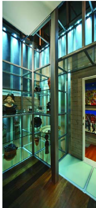
Second-story guest room in pool house

Will there be more remodels? "We're done," Buddy says.